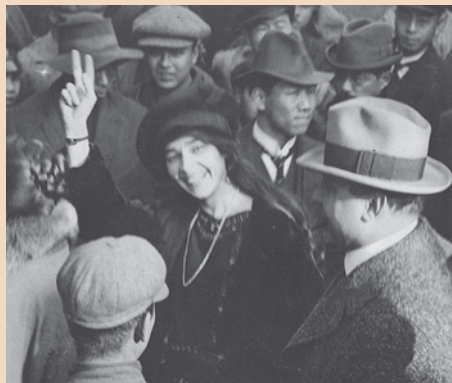
Right: Katherine Stinson waves gaily from a throng of the curious in Tokyo. A newspaper in her hometown of San Antonio, Texas, reported that representatives of the press accompanied her almost everywhere.